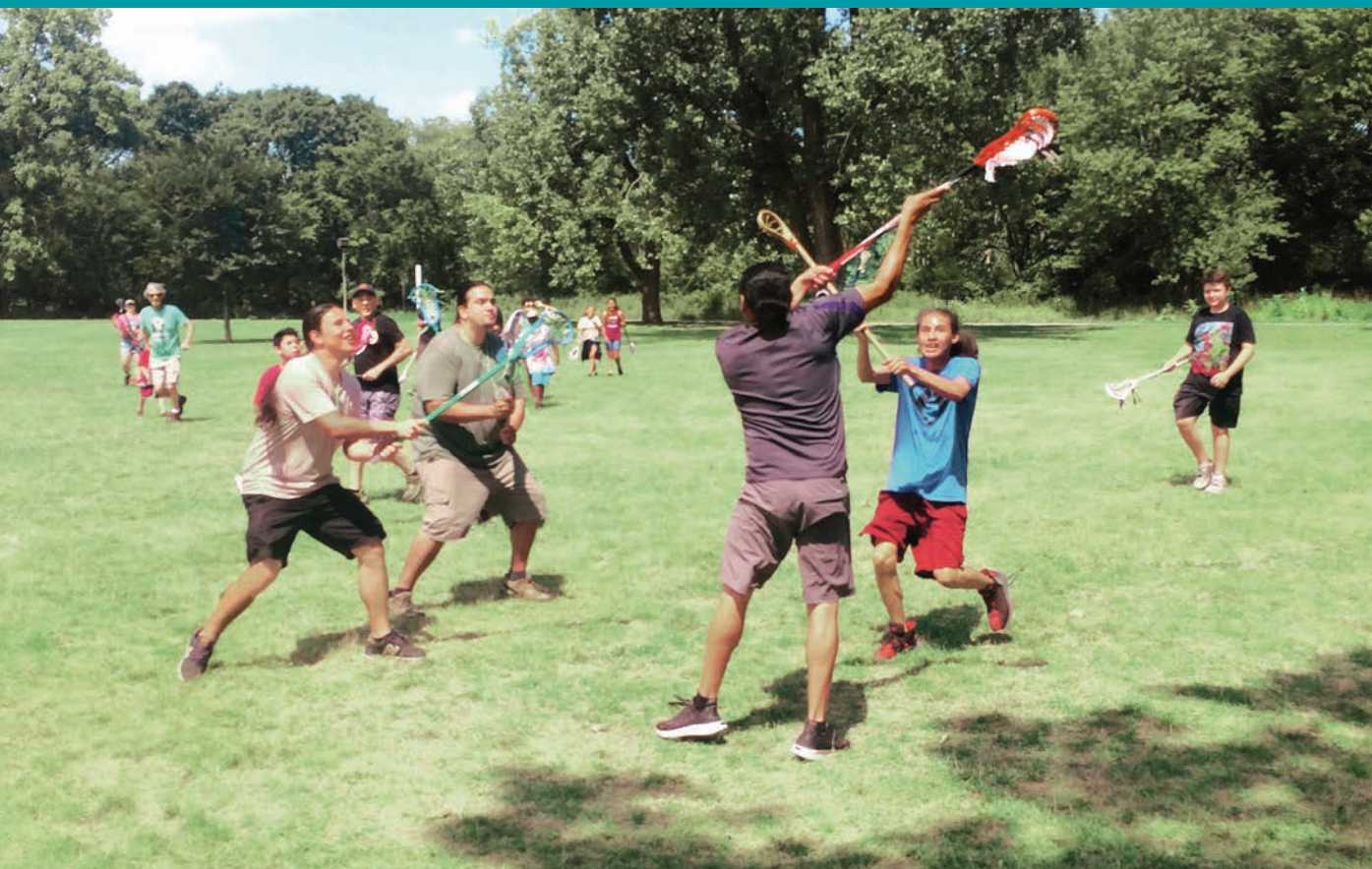
Facilitators and campers playing the traditional Native American game of lacrosse during the ChiSTEAM summer camp

Northwestern University is committed to providing a safe environment free from discrimination, harassment, sexual misconduct, and retaliation. To view Northwestern's complete nondiscrimination statement, see northwestern.edu/equity/policies-procedures/policies/non-discrimination-statement.html , and for crime and safety data, see northwestern.edu/up/your-safety/clery-act-safety-reports.html .